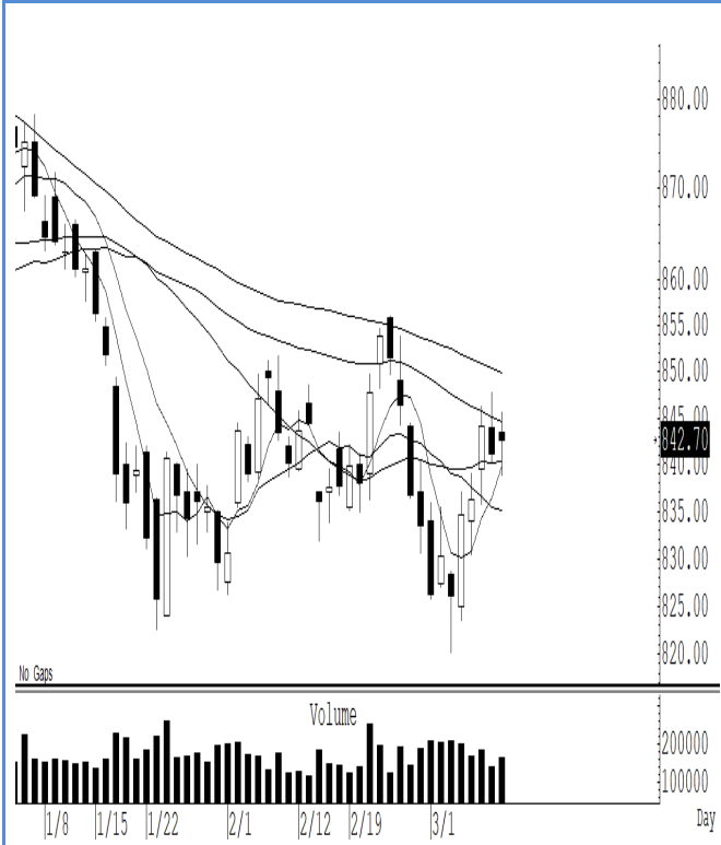
S50H24 (Close 842.70 Chg 1.60)

แกว่งออกด้านข้าง ทำจุดทำใหม่เล็กน้อย ก่อนที่จะฟื้นตัว ทิศทางยังไม่ชัดเจน คาดว่าจะแกว่งออกด้านข้างต่อ สั้น ๆ ไม่ต่ำกว่าแนวรับแถว ๆ 837 จุด แนะนำ trading ในกรอบ 837-850 จุด รับรู้กำไร